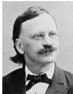
Edward Morley (1838-1923).

As it was believed, the aether is a substance which penetrates the universe and is the medium for the propagation of light like, say, air is the medium for the sound waves. The motionless aether provides a good reference frame to register the motion of Earth. Assuming the velocity addition rule from classical mechanics the scientists expected to detect the difference in the speed of light propagating along and perpendicular to the direction of the Earth motion. No difference was detected. The experiment was later repeated many times at higher accuracy level – the result was negative. The speed of light was measured the same – independent from the direction of light propagation with respect to the Earth motion. All experimental attempts to detect the “aether wind” (in other words “to measure absolute motion”) failed.