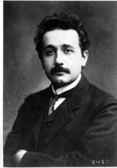
Albert Einstein (1879-1955).

The most interesting feature in the formulae (2) is that now the time “flow” depends on the velocity of the reference of frame. In a moving reference of frame the time “slowed down”. If you, using stopwatch, measure a certain period of time \Delta t (1 hour, say) and your classmate moving at a velocity V with respect to you will measure same time period using his or her stopwatch, you will notice that his (her) time period is longer: