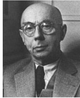
Gustav Hertz (1887-1975)

The idea of the experiment was simple and beautiful. If we will accelerate electrons and made them collide with gas atoms, the electrons may experience inelastic collisions resulting to the transfer of kinetic energy of the electrons to the internal energy of the gas atoms. Discreteness of the internal energy of the gas atoms means that the internal energy can be changed by fixed “portions”. We call this portion “energy quantum” and the discreet energy “quantized”. As long as the kinetic energy of the electron is less than the energy quantum the gas atom cannot absorb it and the inelastic collision cannot happen. If the electron kinetic energy is higher than the energy quantum, the inelastic collision is possible. In this case the electron loses part of its kinetic energy and slows down and the internal energy of the gas atom increases. So, as we increase acceleration of the electrons (i.e. force, applied to the electrons), we will observe that at certain values of the force, applied to the electrons, they slow down very effectively. It will look like the “friction force” experienced by the electrons depends on the accelerating force nonmonotonically.