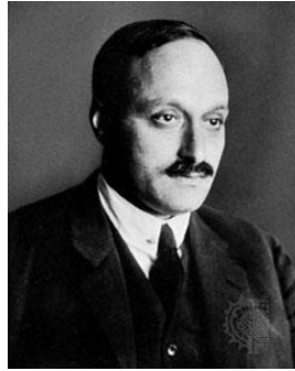
James Franck (1882-1964)

Franck-Hertz experiment is one of the cornerstone experiments of physics which clearly demonstrated discreteness of internal energy of an atom. The experiment was done in 1914 by German physicists James Franck and Gustav Hertz.