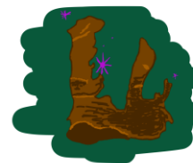
Pillars of Creation, Eagle Nebula