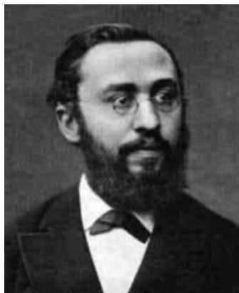
Hendrik Antoon Lorentz (1853-1928)

Magnetic force, described by formula 1, is also called Lorentz force. This name is given after a Dutch physicist Hendrik Antoon Lorentz..