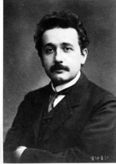
Albert Einstein (1879-1955).

The most interesting feature in the formulae (2) is that now the time “flow” depends on the velocity of the reference of frame. In a moving reference of frame the time “slowed down”. If you, using stopwatch, measure a certain period of time \Delta t (1 hour, say) and your classmate moving at a velocity V with respect to you will measure same time period using his or her stopwatch, you will notice that his (her) time period is longer: