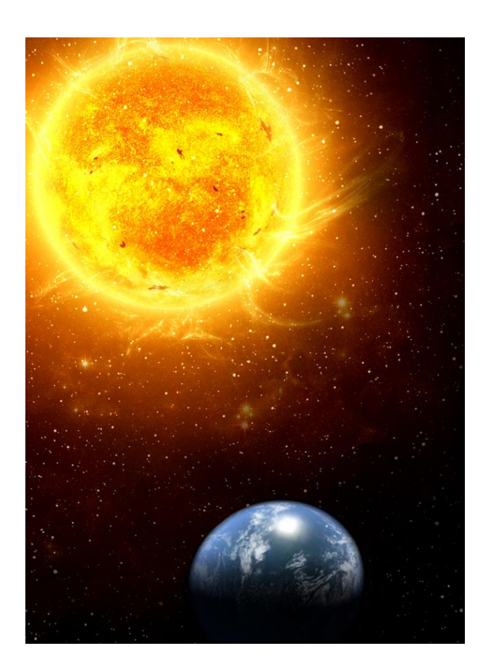
Light from the Sun is reaching the Earth...