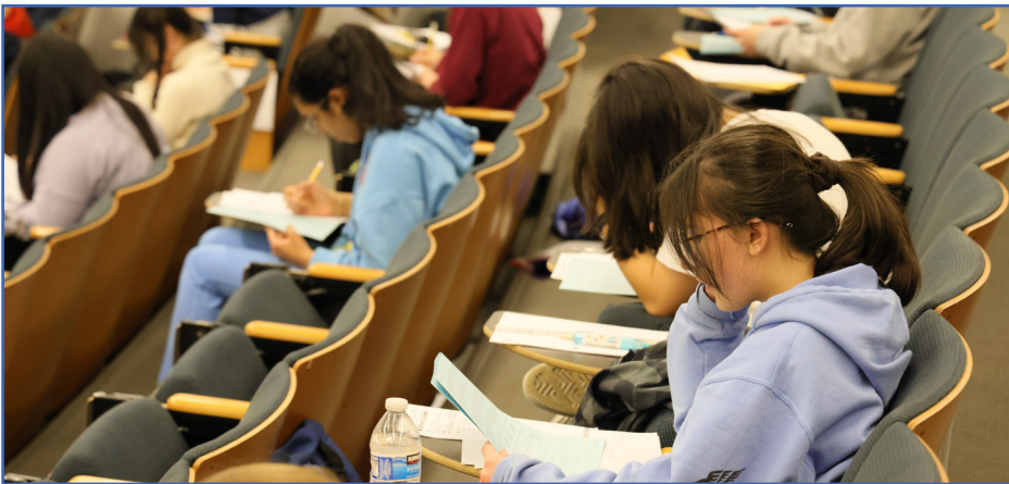
Math Kangaroo competition hosted by SchoolNova, 2023