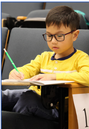
Math Kangaroo, 2023

Today, we want to highlight the tremendous benefits of participating in academic competitions and why it is a transformative experience that can shape kids' personal and educational journey in many remarkable ways.